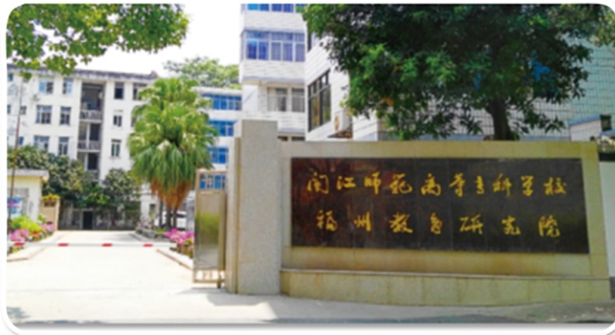
光禄坊校区 Guanglufang Campus