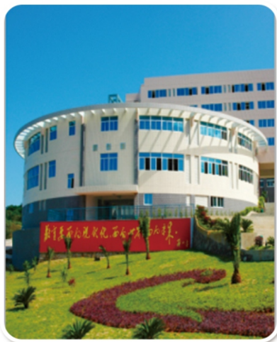
仓山校区 Cangshan Campus