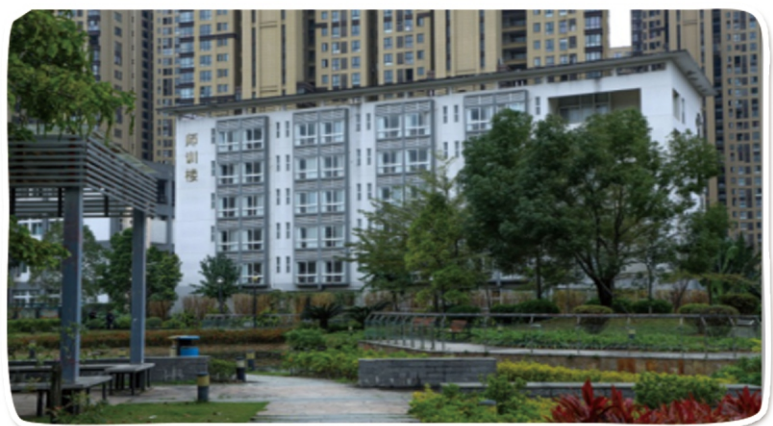
Accommodation of Teacher training building