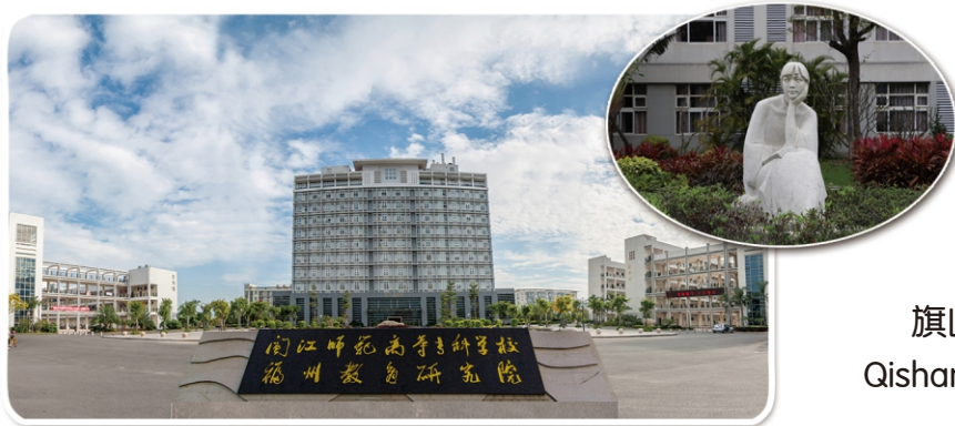
旗山校区 Qishan Campus