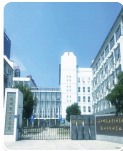
甘蔗校区 Ganzhe Campus