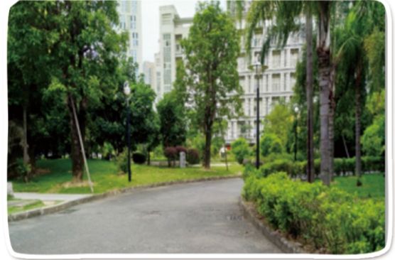
校区四季风景 Four seasons of the Campus