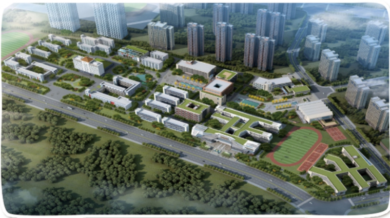
旗山校区二期建设效果图 Renderings of new Qishan Campus