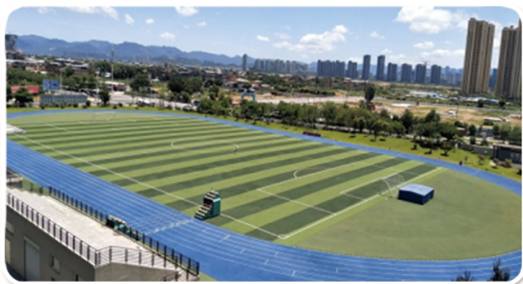
旗山校区操场 Playground in Qishan Campus