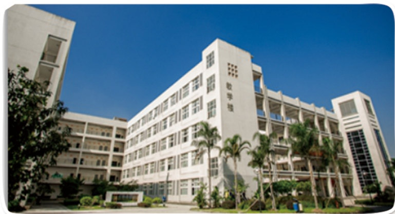
教学楼 Teaching Building